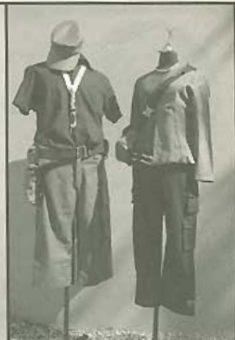
Hemp Clothes and Accessories

longest, strongest vegetable fibre known to man and its woody stalk can be used as a natural sustainable building product or moulded into cloth. Hemp seeds are also highly nutritional as they contain the optimum ratio of essential fatty acids for our body, making it a useful food source.