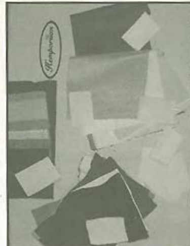
Hemp fabric can be spun as smooth as silk or as coarse as sackcloth