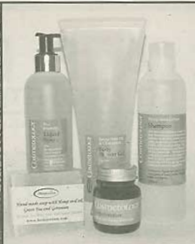
Hemp cosmetics made with omega rich hemp seed oil